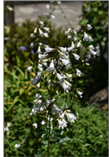
Foxglove Beardtongue flowers

Foxglove Beardtongue is recommended for the following landscape applications;