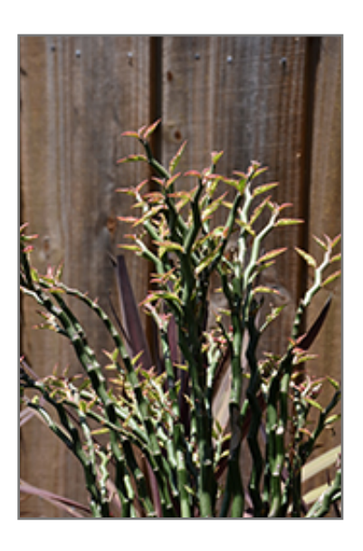
Redbird Flower foliage

When grown indoors, Redbird Flower can be expected to grow to be about 24 inches tall at maturity, with a spread of 12 inches. It grows at a medium rate, and under ideal conditions can be expected to live for approximately 10 years. This houseplant will do well in a location that gets either direct or indirect sunlight, although it will usually require a more brightly-lit environment than what artificial indoor lighting alone can provide. It does best in average to evenly moist soil, but will not tolerate standing water. The surface of the soil shouldn't be allowed to dry out completely, and so you should expect to water this plant once and possibly even twice each week. Be aware that your particular watering schedule may vary depending on its location in the room, the pot size, plant size and other conditions; if in doubt, ask one of our experts in the store for advice. It will benefit from a regular feeding with a general-purpose fertilizer with every second or third watering. It is not particular as to soil type or pH; an average potting soil should work just fine. Be warned that parts of this plant are known to be toxic to humans and animals, so special care should be exercised if growing it around children and pets.