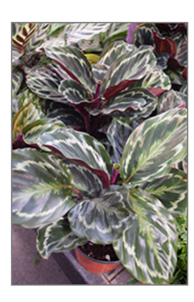
Medallion Calathea foliage

When grown indoors, Medallion Calathea can be expected to grow to be about 30 inches tall at maturity, with a spread of 24 inches. It grows at a slow rate, and under ideal conditions can be expected to live for approximately 5 years. This houseplant performs well in both bright or indirect sunlight and strong artificial light, and can therefore be situated in almost any well-lit room or location. It does best in average to evenly moist soil, but will not tolerate standing water. The surface of the soil shouldn't be allowed to dry out completely, and so you should expect to water this plant once and possibly even twice each week. Be aware that your particular watering schedule may vary depending on its location in the room, the pot size, plant size and other conditions; if in doubt, ask one of our experts in the store for advice. It will benefit from a regular feeding with a general-purpose fertilizer with every second or third watering. It is not particular as to soil pH, but grows best in rich soil. Contact the store for specific recommendations on pre-mixed potting soil for this plant.