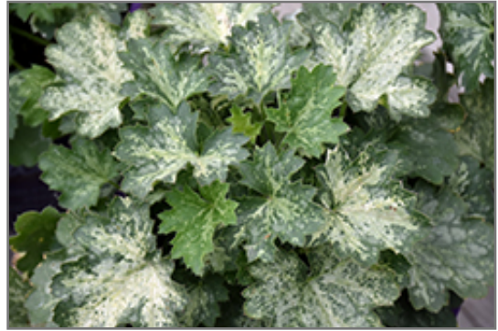
Dew Drops Coral Bells foliage