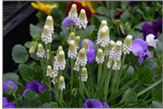
White Magic Grape Hyacinth flowers