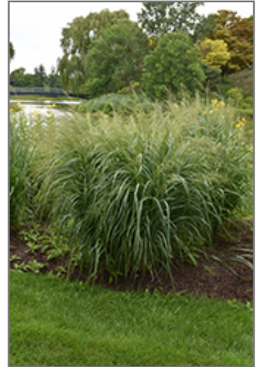
Bad Hair Day Switch Grass in bloom