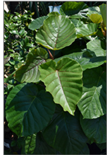
Lily Pads Umbellata Umbrella Fig Tree foliage

When grown indoors, Lily Pads Umbellata Umbrella Fig Tree can be expected to grow to be about 6 feet tall at maturity, with a spread of 4 feet. It grows at a medium rate, and under ideal conditions can be expected to live for approximately 20 years. This houseplant will do well in a location that gets either direct or indirect sunlight, although it will usually require a more brightly-lit environment than what artificial indoor lighting alone can provide. It does best in average to evenly moist soil, but will not tolerate standing water. The surface of the soil shouldn't be allowed to dry out completely, and so you should expect to water this plant once and possibly even twice each week. Be aware that your particular watering schedule may vary depending on its location in the room, the pot size, plant size and other conditions; if in doubt, ask one of our experts in the store for advice. It will benefit from a regular feeding with a general-purpose fertilizer with every second or third watering. It is not particular as to soil type or pH; an average potting soil should work just fine. Be warned that parts of this plant are known to be toxic to humans and animals, so special care should be exercised if growing it around children and pets.