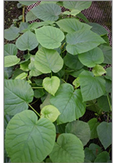
Umbellata Fig Tree foliage

This is a multi-stemmed evergreen houseplant with an upright spreading habit of growth. Its relatively coarse texture stands it apart from other indoor plants with finer foliage. This plant should not require much pruning, except when necessary to keep it looking its best.