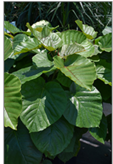
Umbellata Fig Tree foliage