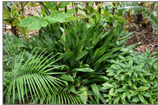
Galaxy Cast Iron Plant