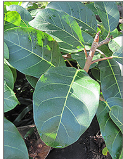
Giant-leaved Fig foliage

When grown indoors, Giant-leaved Fig can be expected to grow to be about 8 feet tall at maturity, with a spread of 5 feet. It grows at a fast rate, and under ideal conditions can be expected to live for approximately 100 years. This houseplant will do well in a location that gets either direct or indirect sunlight, although it will usually require a more brightly-lit environment than what artificial indoor lighting alone can provide. It does best in average to evenly moist soil, but will not tolerate standing water. The surface of the soil shouldn't be allowed to dry out completely, and so you should expect to water this plant once and possibly even twice each week. Be aware that your particular watering schedule may vary depending on its location in the room, the pot size, plant size and other conditions; if in doubt, ask one of our experts in the store for advice. It will benefit from a regular feeding with a general-purpose fertilizer with every second or third watering. It is not particular as to soil type or pH; an average potting soil should work just fine. Be warned that parts of this plant are known to be toxic to humans and animals, so special care should be exercised if growing it around children and pets.