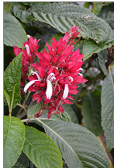
Brazilian Red Coat flowers

This is a dense multi-stemmed evergreen houseplant with a more or less rounded form. Its relatively coarse texture stands it apart from other indoor plants with finer foliage. This plant may benefit from an occasional pruning to look its best.