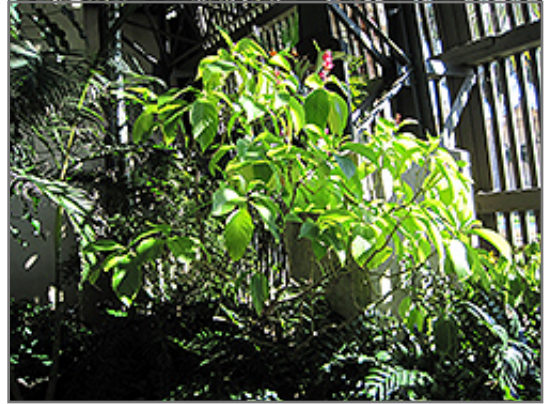
Brazilian Red Coat in bloom

When grown indoors, Brazilian Red Coat can be expected to grow to be about 5 feet tall at maturity, with a spread of 3 feet. It grows at a medium rate, and under ideal conditions can be expected to live for approximately 20 years. This houseplant will do well in a location that gets either direct or indirect sunlight, although it will usually require a more brightly-lit environment than what artificial indoor lighting alone can provide. It does best in average to evenly moist soil, but will not tolerate standing water. The surface of the soil shouldn't be allowed to dry out completely, and so you should expect to water this plant once and possibly even twice each week. Be aware that your particular watering schedule may vary depending on its location in the room, the pot size, plant size and other conditions; if in doubt, ask one of our experts in the store for advice. It will benefit from a regular feeding with a general-purpose fertilizer with every second or third watering. It is not particular as to soil type or pH; an average potting soil should work just fine.