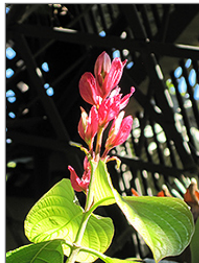
Brazilian Red Coat flowers