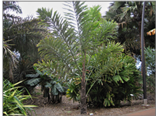
Distichous Fishtail Palm

Distichous Fishtail Palm is a fine choice for the yard, but it is also a good selection for planting in outdoor pots and containers. Because of its height, it is often used as a 'thriller' in the 'spiller-thriller-filler' container combination; plant it near the center of the pot, surrounded by smaller plants and those that spill over the edges. It is even sizeable enough that it can be grown alone in a suitable container. Note that when grown in a container, it may not perform exactly as indicated on the tag - this is to be expected. Also note that when growing plants in outdoor containers and baskets, they may require more frequent waterings than they would in the yard or garden.