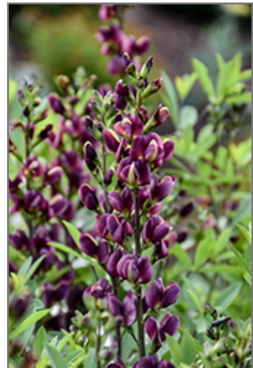
Burgundy Blast False Indigo flowers