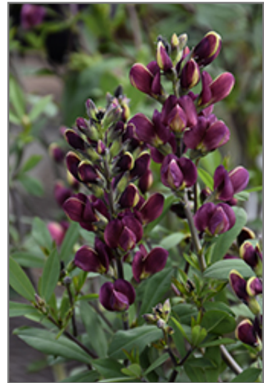
Burgundy Blast False Indigo flowers