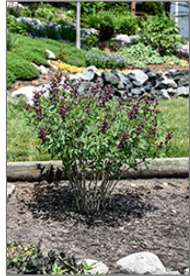
Burgundy Blast False Indigo in bloom

Burgundy Blast False Indigo is a fine choice for the garden, but it is also a good selection for planting in outdoor pots and containers. With its upright habit of growth, it is best suited for use as a 'thriller' in the 'spiller-thriller-filler' container combination; plant it near the center of the pot, surrounded by smaller plants and those that spill over the edges. It is even sizeable enough that it can be grown alone in a suitable container. Note that when growing plants in outdoor containers and baskets, they may require more frequent waterings than they would in the yard or garden.