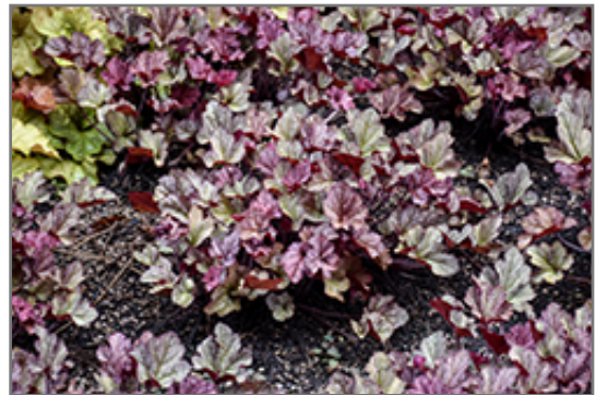
Coralberry Coral Bells