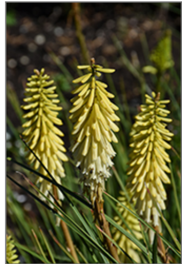
Poco Citron Torchlily flowers

Poco Citron Torchlily is recommended for the following landscape applications;