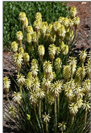
Poco Citron Torchlily flowers