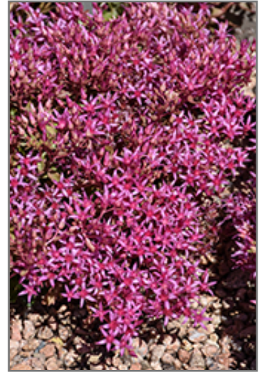
Rock Candy Stonecrop flowers

Rock Candy Stonecrop is recommended for the following landscape applications;