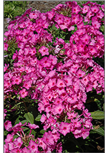
Flame Pink Garden Phlox flowers