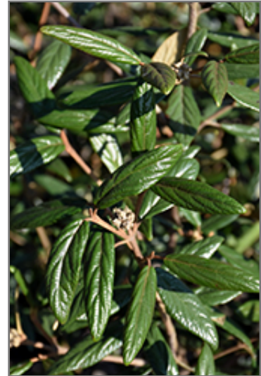
Prague Viburnum foliage

This shrub does best in full sun to partial shade. It prefers to grow in average to moist conditions, and shouldn't be allowed to dry out. It is not particular as to soil type or pH. It is highly tolerant of urban pollution and will even thrive in inner city environments. This particular variety is an interspecific hybrid.