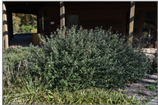
Prague Viburnum