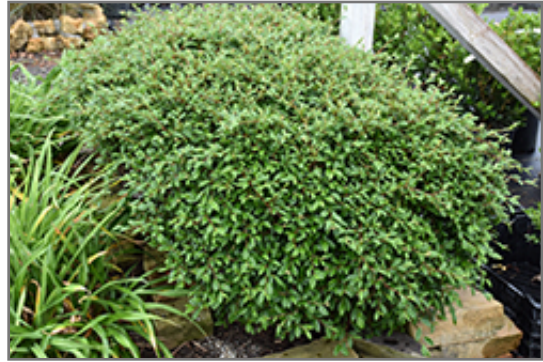
Scarlet Leader Willowleaf Cotoneaster

This shrub will require occasional maintenance and upkeep, and should not require much pruning, except when necessary, such as to remove dieback. It is a good choice for attracting birds to your yard, but is not particularly attractive to deer who tend to leave it alone in favor of tastier treats. Gardeners should be aware of the following characteristic(s) that may warrant special consideration;