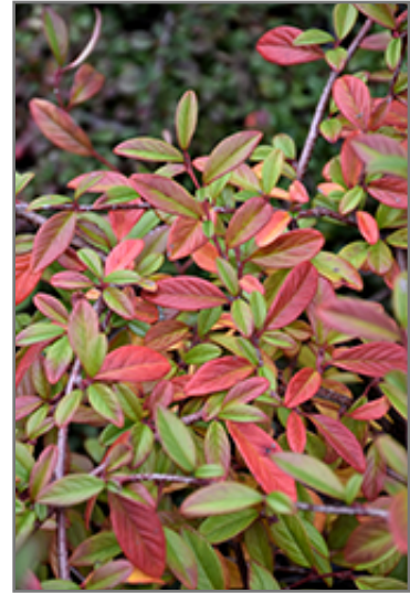
Scarlet Leader Willowleaf Cotoneaster in fall

* This is a 'special order' plant - contact store for details