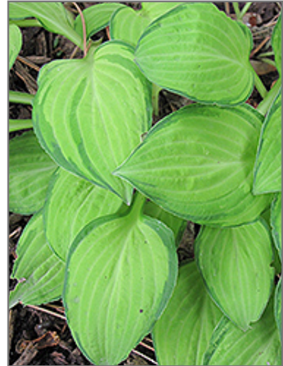
Emerald Tiara Hosta foliage

Emerald Tiara Hosta is recommended for the following landscape applications;