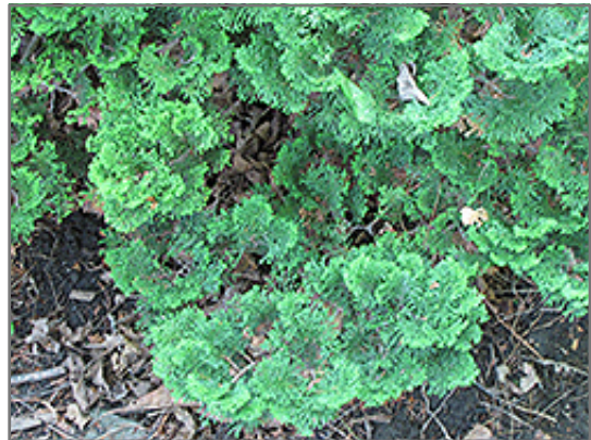
Nana Dwarf Hinoki Falsecypress foliage