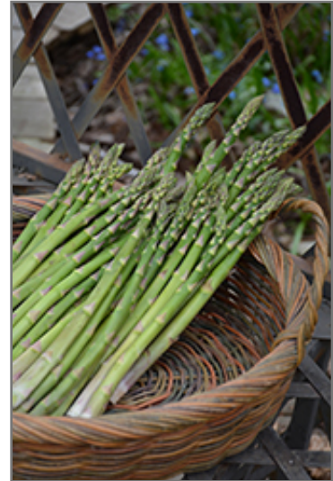
Jersey Supreme Asparagus fruit

This plant is typically grown in a designated vegetable garden. It does best in full sun to partial shade. It does best in average to evenly moist conditions, but will not tolerate standing water. It is not particular as to soil pH, but grows best in rich soils. It is somewhat tolerant of urban pollution. This is a selected variety of a species not originally from North America.